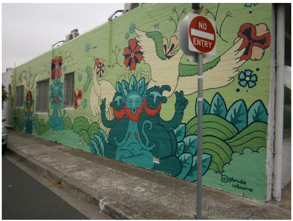
(Artist - Brodie Colbourne)

Throw Ups: Throw ups or 'throwies' refer to tags written in fat, bubble-style writing. They are usually drawn quickly with spray paint and commonly feature two colours. One colour is used to outline the tag and the other is used to fill.