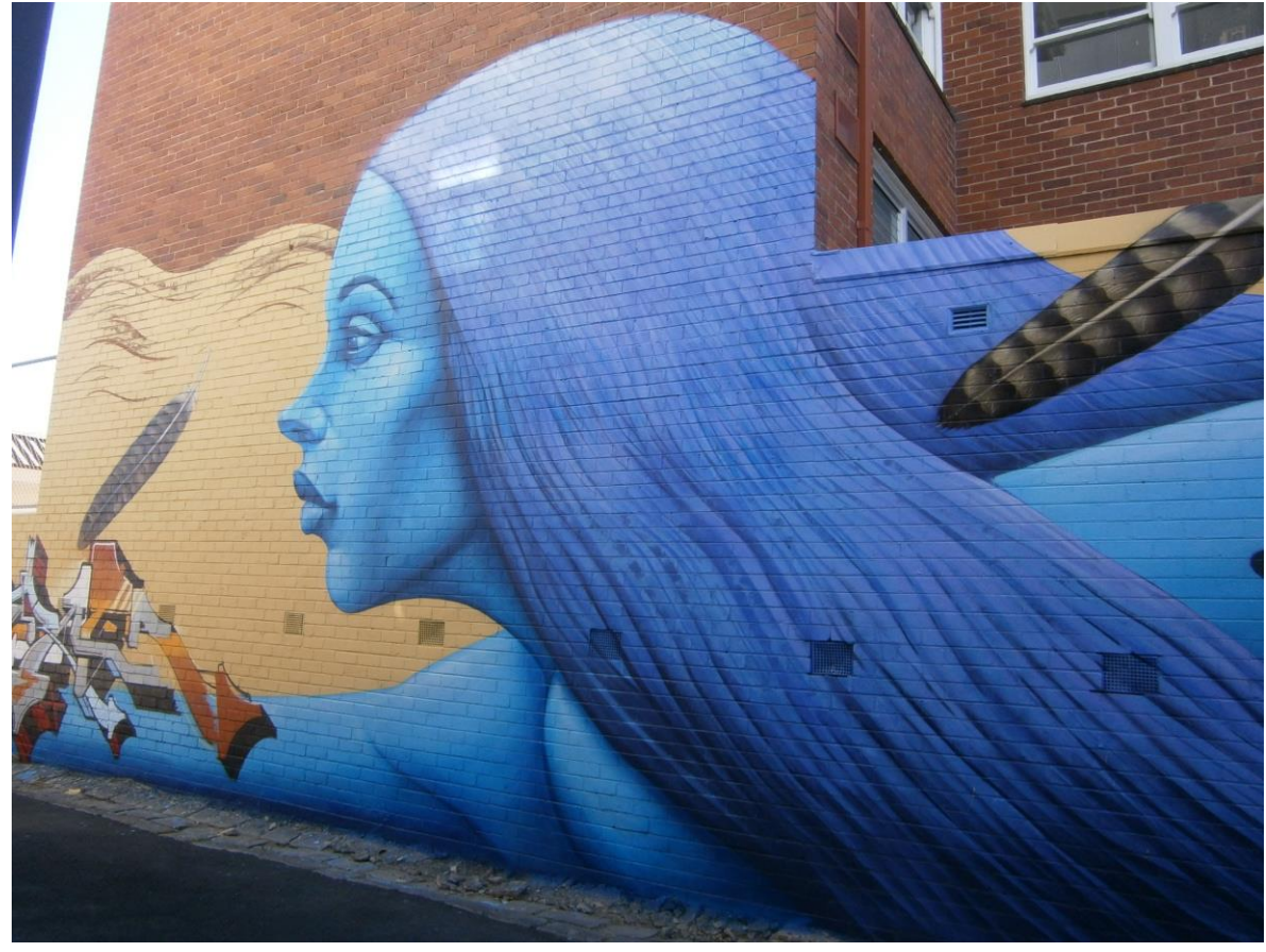
(Artist – Hayden Dewar)

Council also recognises and pays tribute to, and celebrates, Darebin's long standing Aboriginal and Torres Strait Islander culture and heritage.