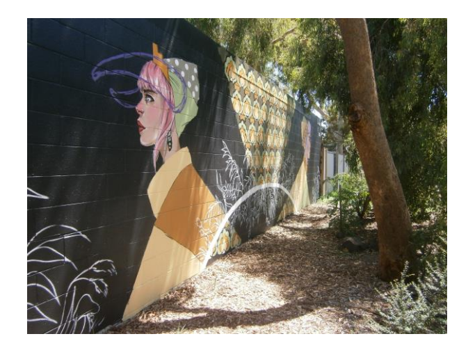
(Artist – Lucy Lucy)