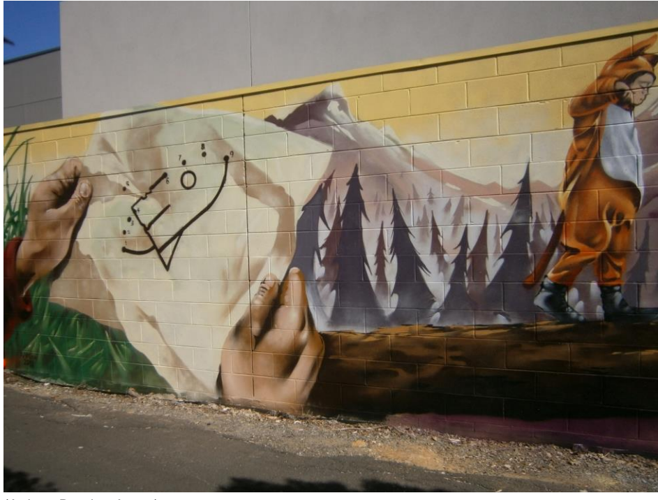
(Artist - Damien Arena)

The pie chart below outlines areas in Darebin with a high concentration of graffiti on public and private assets. These sites have been deemed graffiti hotspots and will form the focus of Council's removal activity and initiatives outlined in this strategy.