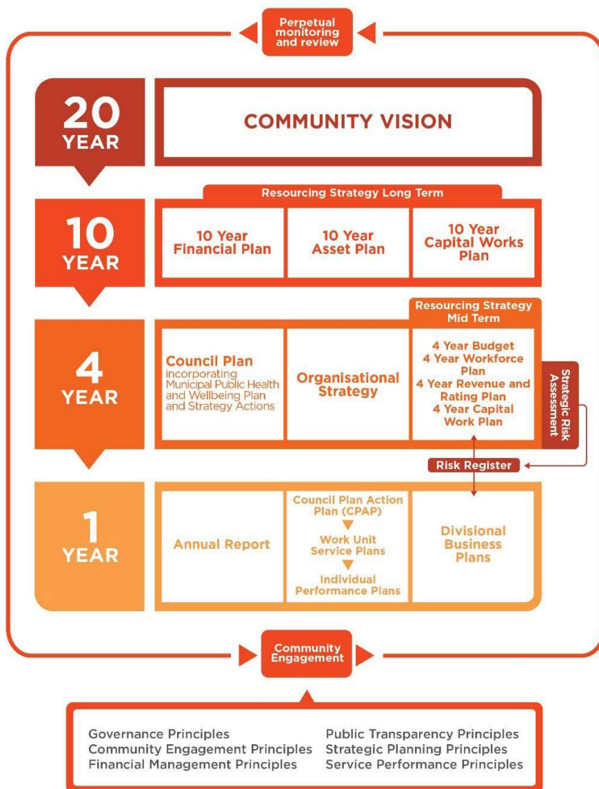
Diagram 1 – Council's Integrated Planning and Reporting Framework

This plan explains how Council calculates the revenue needed to fund its activities, and how the funding burden will be apportioned between ratepayers and other users of Council facilities and services.