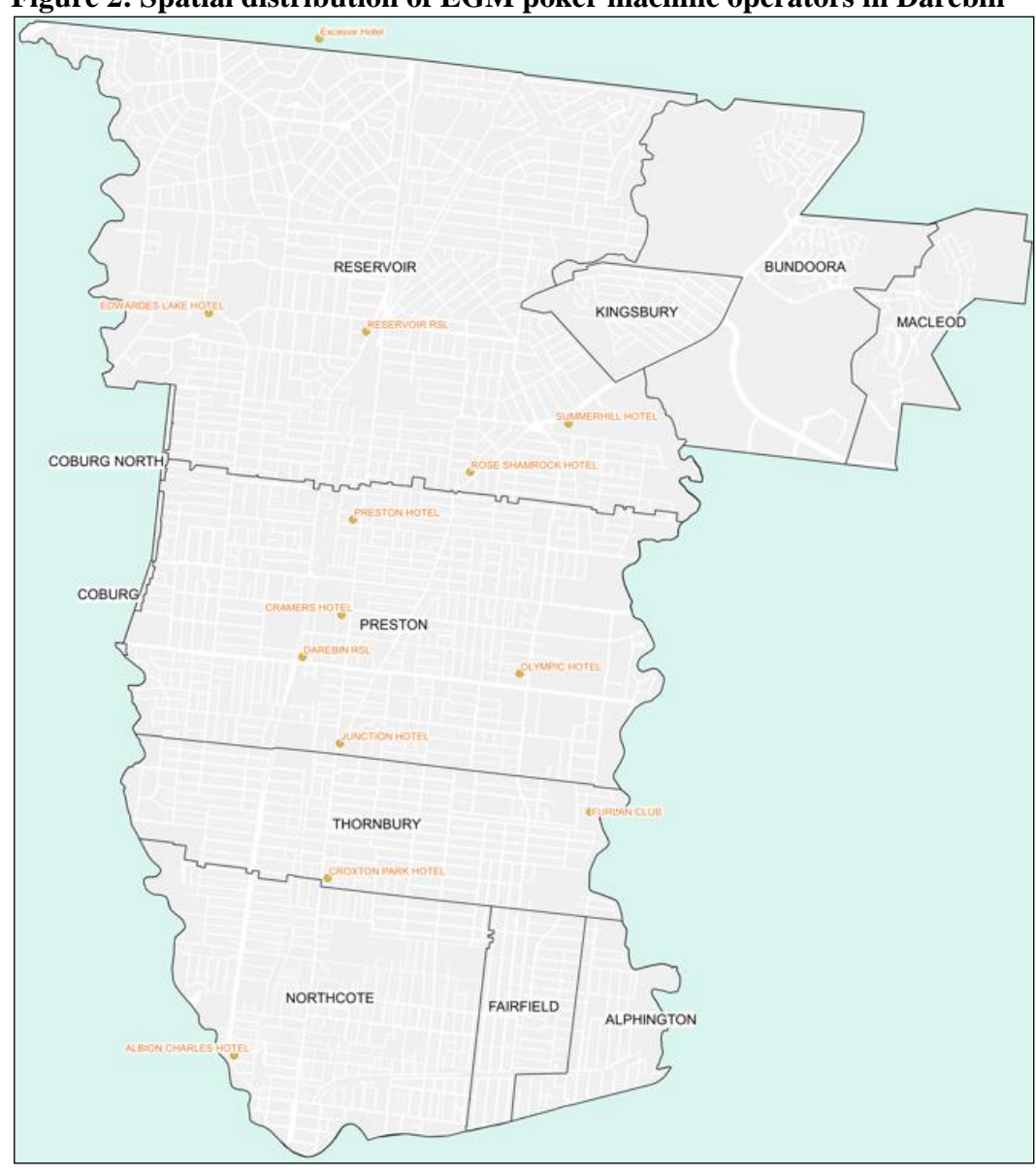
Figure 2: Spatial distribution of EGM poker machine operators in Darebin

venues in the City of Darebin, which is 97% of the legal limit. <sup>2</sup> Figure 2 shows spatial distribution of EGM venues in Darebin.