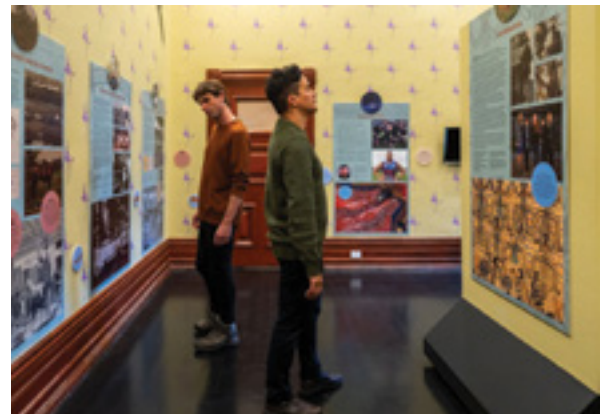
The new permanent history and cultural display at the Bundoora Homestead Art Centre

Darebin Council officers have been meeting with Wurundjeri Woi-wurrung Elders and staff regularly for Cultural Workshops where stories are shared and key choices made to shape the display, learning material and physical display design. Council is working with a Melbourne based artist to bring this vision to life. The next workshop is scheduled for April and we look forward to opening the Display to the public in late 2025-early 2026.